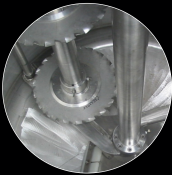
MULTI-BLADE DUAL SHAFT